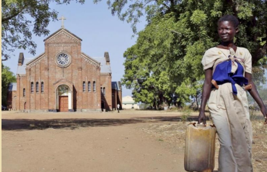
A girl walks with a jug to retrieve water near a church in Rajaf, South Sudan